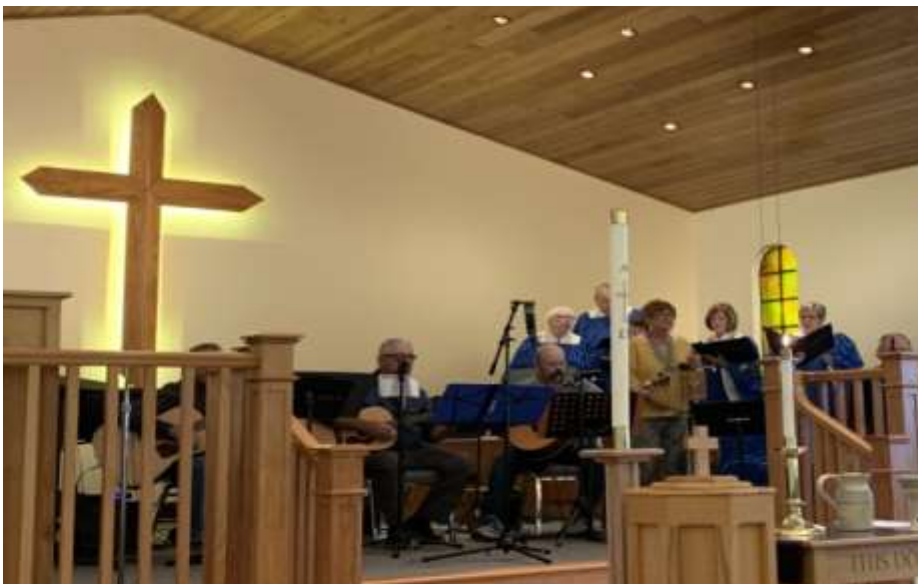
Orange Harbour Pickin' & Grinning