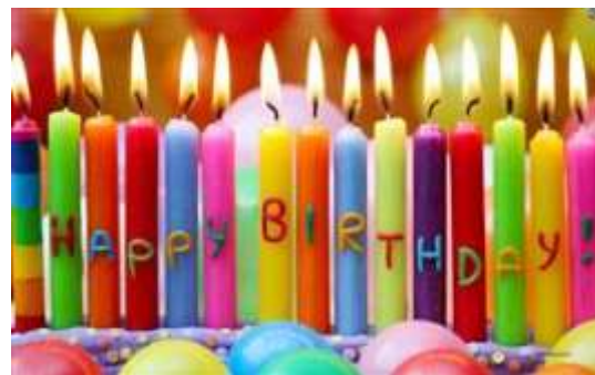
HAPPY 91ST BIRTHDAY KATHERINE NOLEN!